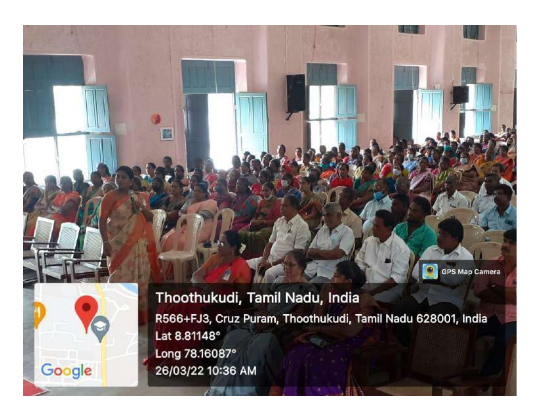
<u>Parent – Teacher Association Meeting Report (9.4.2022)</u> (For II UG Students)

The Parent-Teachers Association Meeting for the academic year 2021-2022 was held on 9<sup>th</sup> April 2022 for the parents of II UG students in the college auditorium.